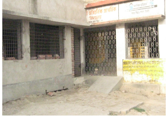
The school building

Infact, Bamanpukur Ramkrishna Sevashram, a nearby Ashram, has started Pathachakra for these students, but they are unable to attend owing to the problem they face in walking down to the venue. Most of the students leave school after 6th or 7th standard. Only 5 students have passed Higher Secondary and 15 students have passed Secondary examination.